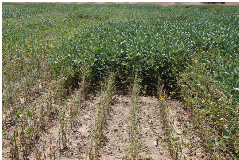
Planting soybean varieties with resistance to SDS can help manage the disease. This shows the differing varietal responses of more resistant plants (back) compared to those that are more susceptible (front).

An integrated SDS management strategy is necessary since a single management tactic alone is not likely to provide adequate results. Management strategies include planting soybean varieties with resistance to SDS, using effective fungicide seed treatments, avoiding or reducing soil compaction, improving soil drainage in fields with recurring SDS, and maintaining proper pH and fertility levels.