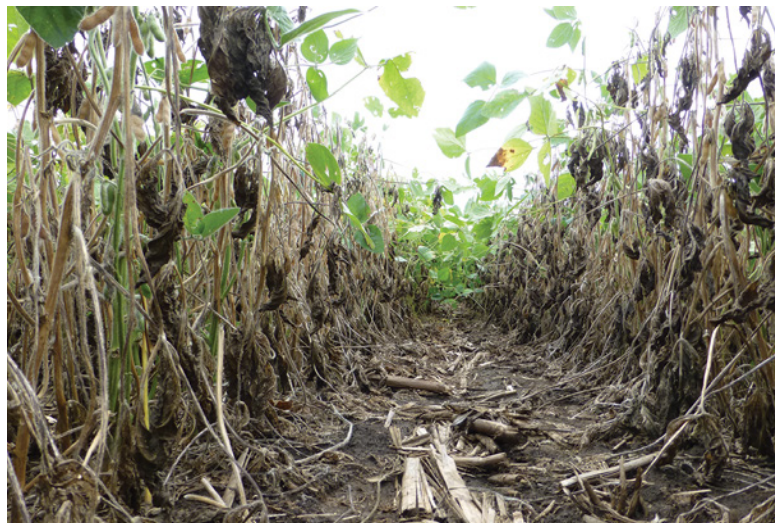
Leaves of plants with stem canker remain attached after wilting, unlike symptoms of SDS.