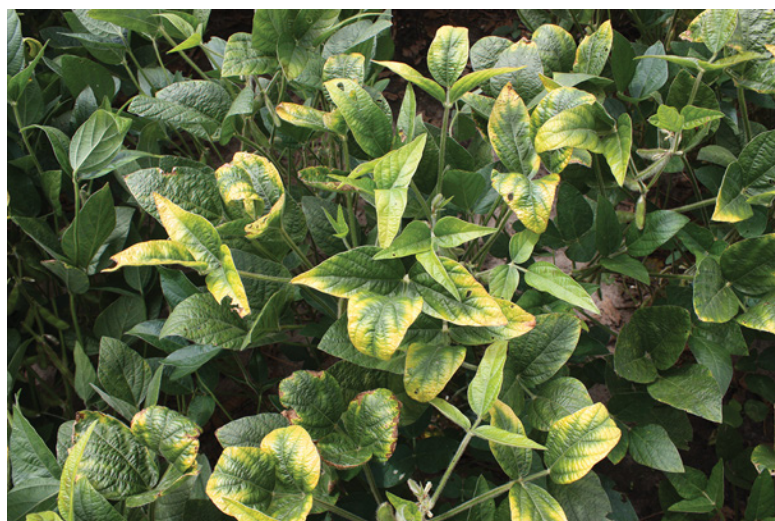
Potassium deficiency symptoms.