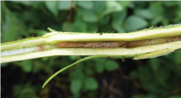
Pith discoloration in the stem distinguishes brown stem rot from SDS.