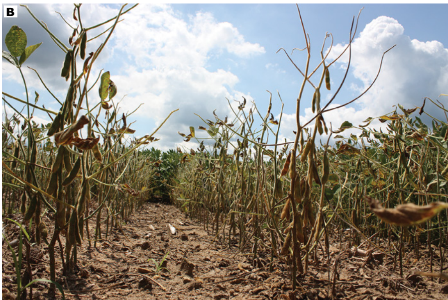
(A) Interveinal chlorosis and necrosis from SDS and (B) Defoliated plants from SDS with petioles still attached.