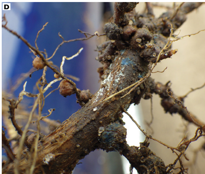
(C) Taproot discoloration symptoms of SDS and (D) Blue fungal growth on roots.